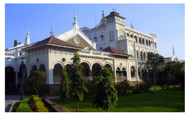
Aga Khan Palace

The Aga Khan Palace was built by Sultan Muhammed Shah Aga Khan III in Pune, India. Built in 1892, it is one of important landmarks in Indian history.